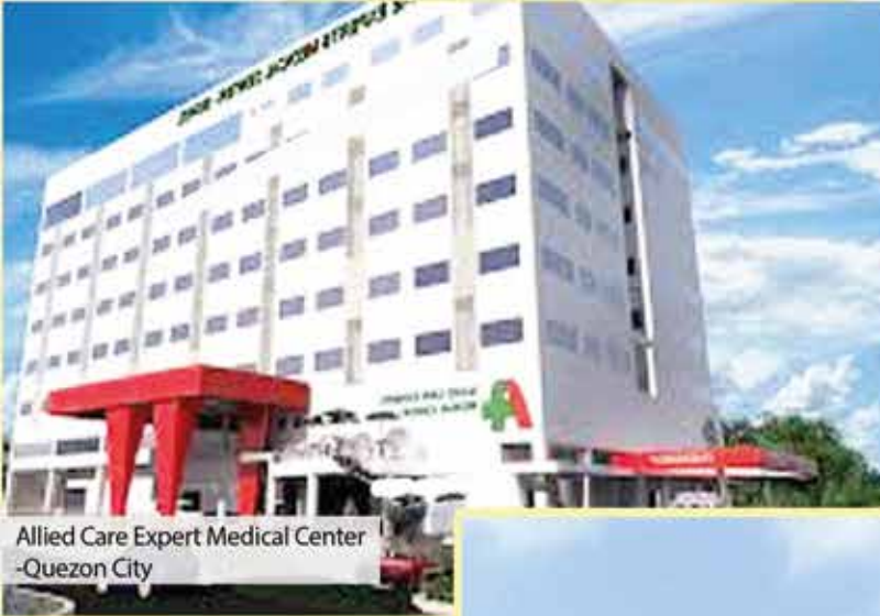
Allied Care Expert Medical Center -Quezon City