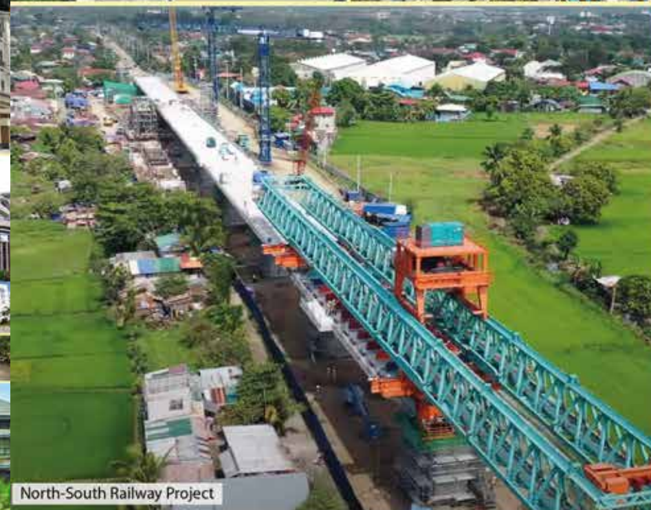
North-South Railway Project