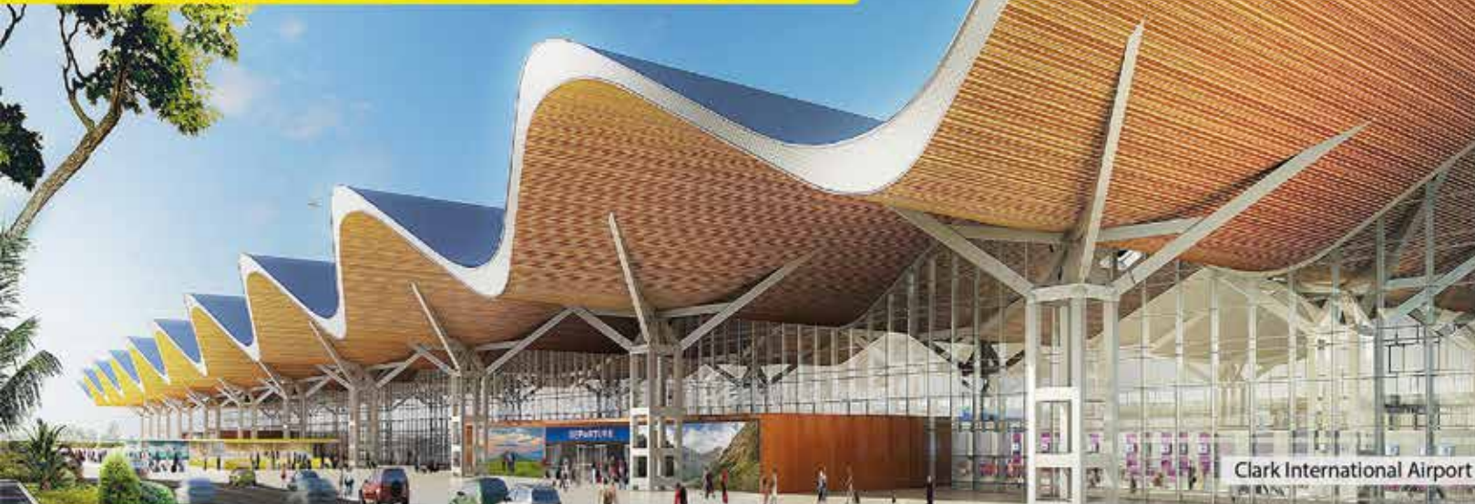
Clark International Airport