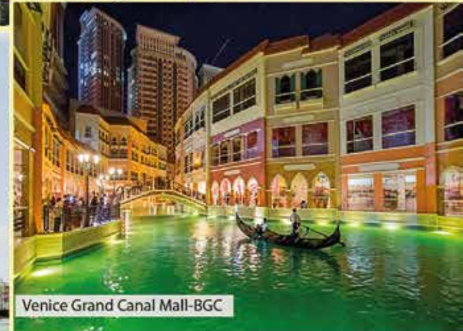
Venice Grand Canal Mall-BGC