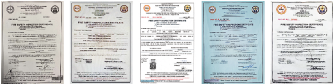
Fire Safety Inspection Certificates

Plant facilities and offices are duly inspected annually in compliance with the fire safety and protection requirements of the Fire Code of the Philippines 2008 and its Revised Implementing Rules and Regulations. Fire Safety Inspection Certificates are issued to the company for each location.