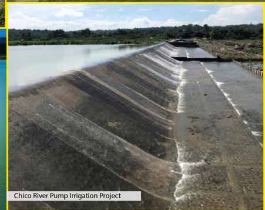
Chico River Pump Irrigation Project