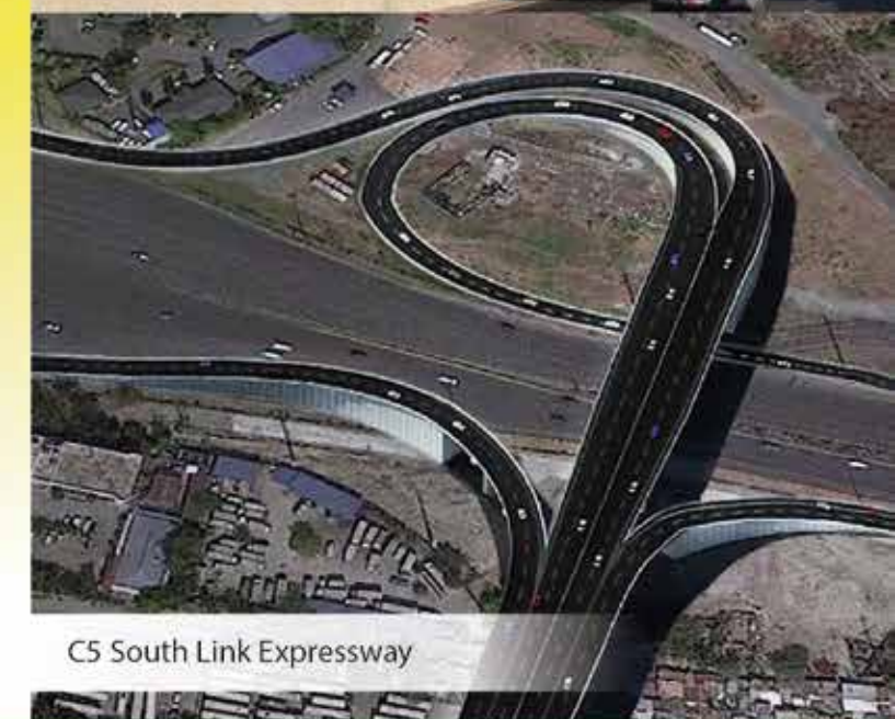
C5 South Link Expressway