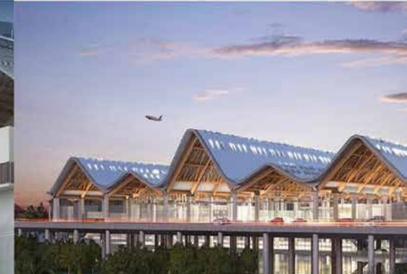
Clark International Airport New Passenger Terminal Building

Being a reliable partner for these infrastructure projects build a stronger impact on Crown's image as a truly premium brand and for Crown Asia Chemicals Corporation's enduring reputation as a major manufacturer, trusted by industry professionals.