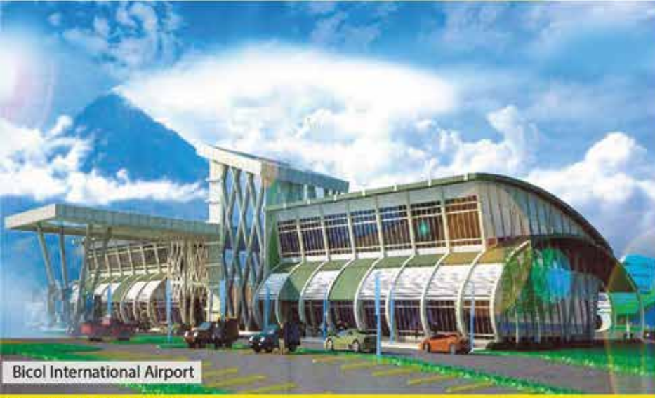
Bicol International Airport