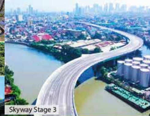
Skyway Stage 3