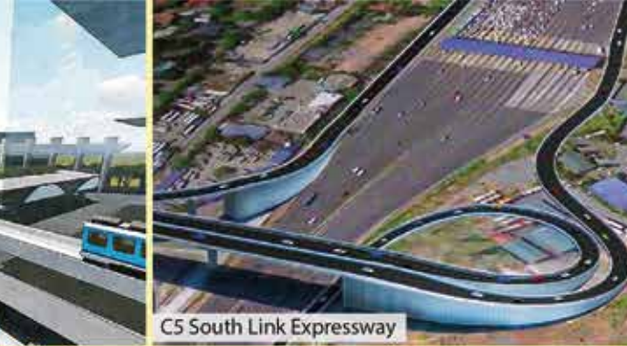
CS South Link Expressway