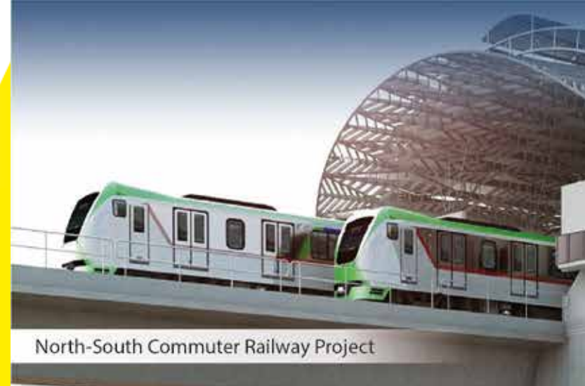
North-South Commuter Railway Project

The country's first subway system involves the first and second construction section of the Metro Manila Subway that will operate prior to other sections. The other part of the project is the Davao City Bypass Construction project of the South-Central section.