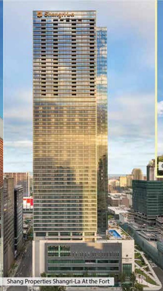
Shang Properties Shangri-La At the Fort