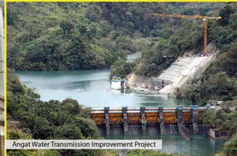
Angat Water Transmission Improvement Project