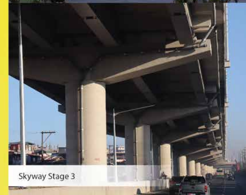
Skyway Stage 3