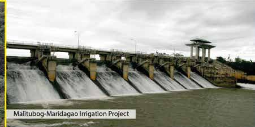
Malitbog-Maridagao Irrigation Project