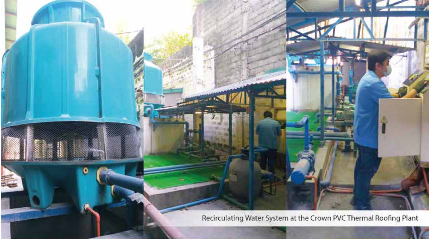
Recirculating Water System at the Crown PVC Thermal Roofing Plant