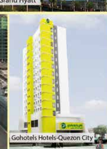
Gohotels Hotels-Quezon City