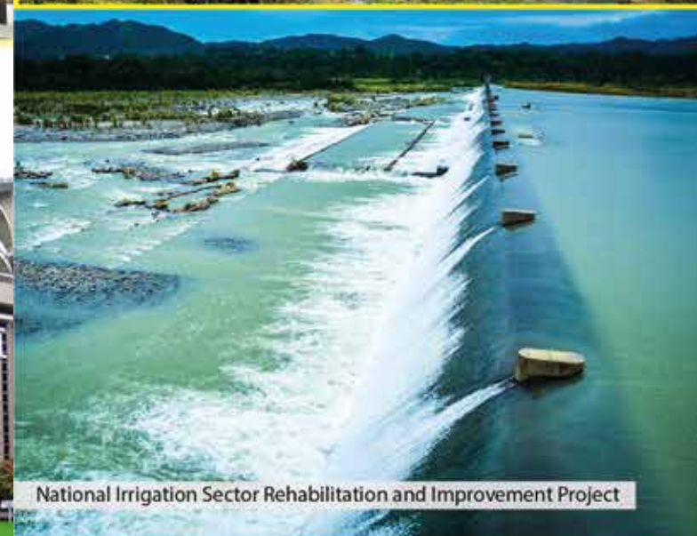
National Irrigation Sector Rehabilitation and Improvement Project