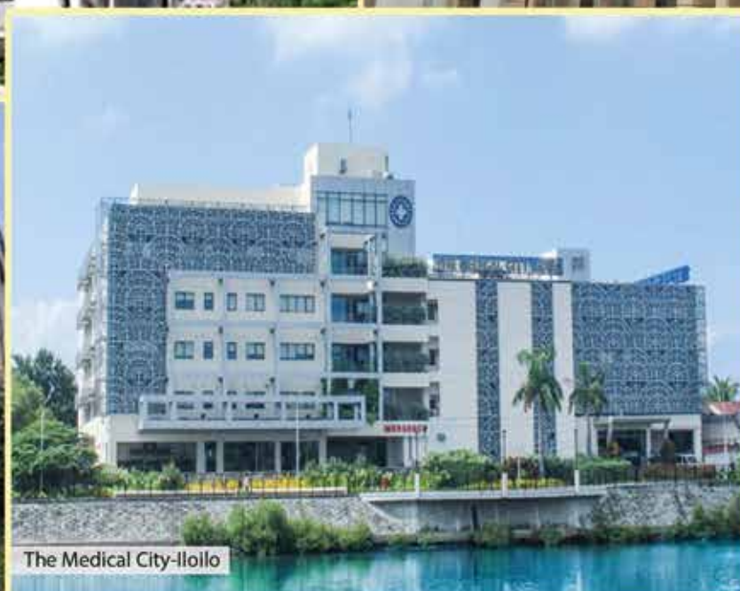
The Medical City-Iloilo